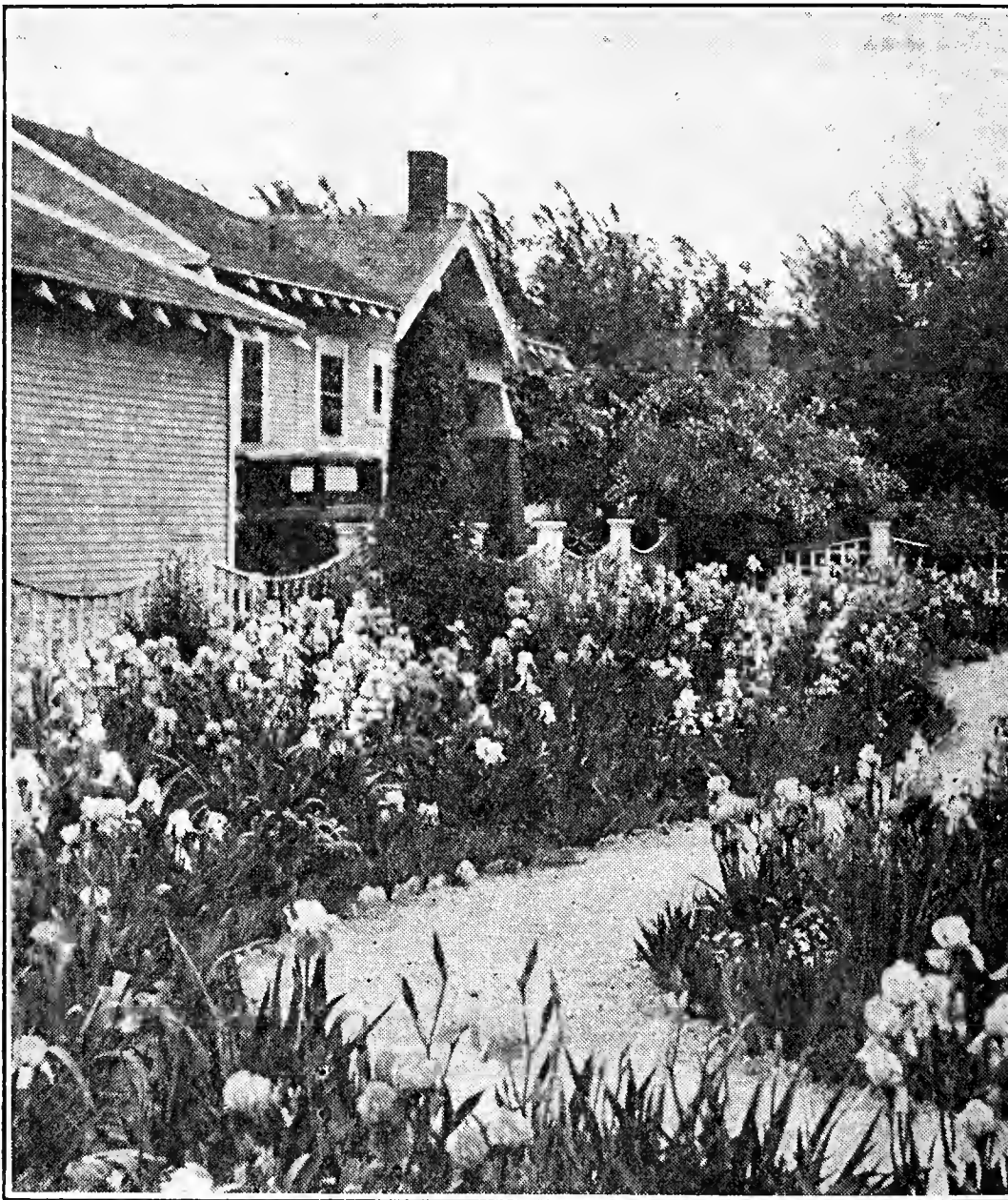
“THE GARDEN IS THE OUTDOOR OF